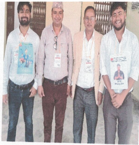
15. Welcome program conducted by student Union and campus for newly admitted student of graduate and undergraduate level 2081 on 2081/11/20