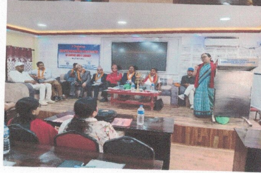
14. On 2081/12/27 Election of Student Union completed peacefully under the norms of Far-University .