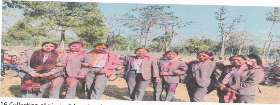
16. Collection of picnic, Educational tour and Industrial tour